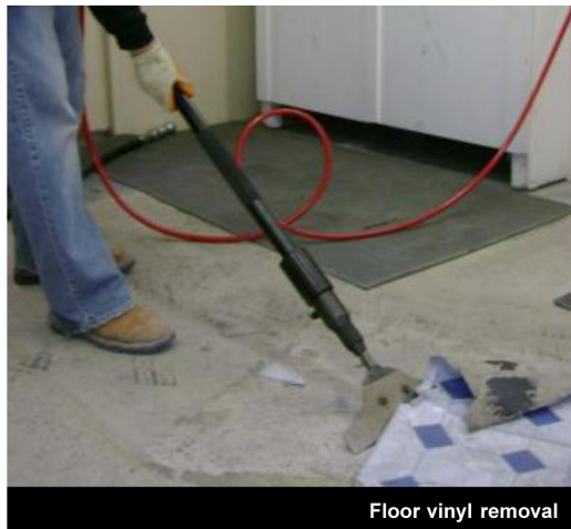
Floor vinyl removal